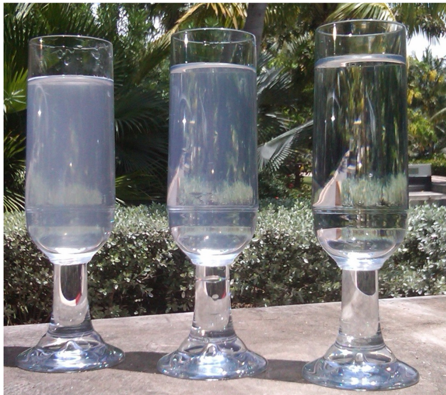
Left: Laundry Effluent Before Treatment

The benefit of the GEM System followed by UF is shown below: